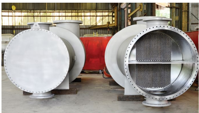
(2) 2205 Duplex Stainless Heat Exchangers