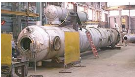
Column with Heat Exchanger Trial Fit-Up