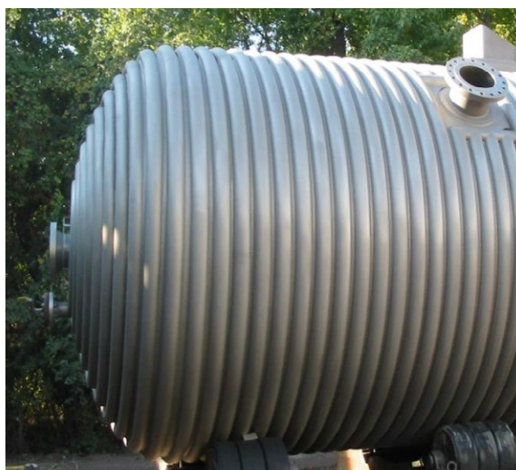
Half-pipe reactor with coverage over entire head