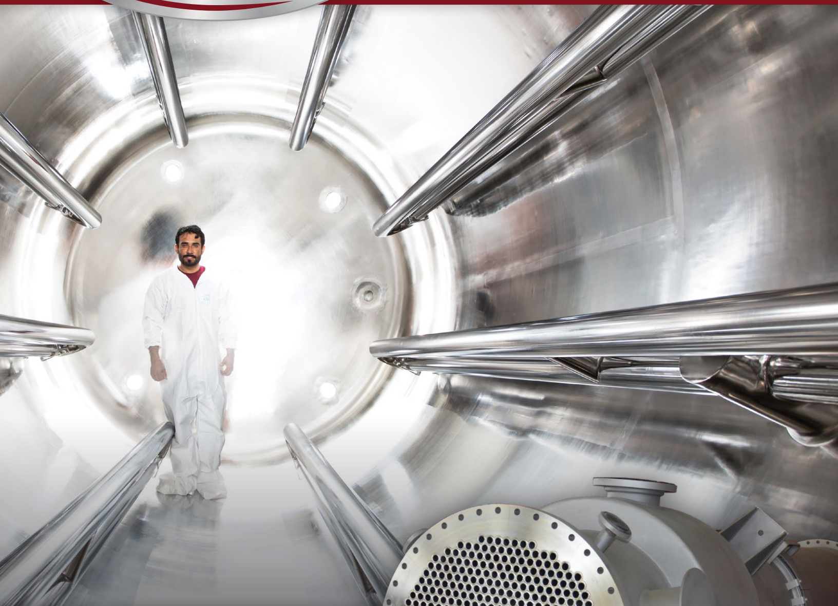
10 Ra. Max Polished Clad Reactor

INNOVATIVE IDEAS WITH CUSTOMIZED SOLUTIONS