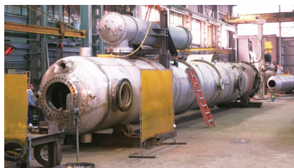
Column with Heat Exchanger Trial Fit-Up