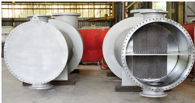
(2) 2205 Duplex Stainless Heat Exchangers