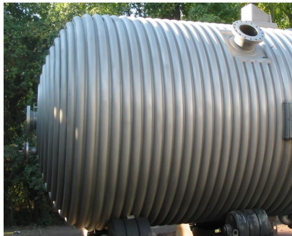
Half-pipe reactor with coverage over entire head