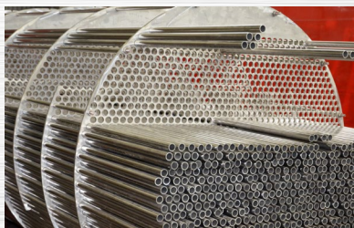
Alloy 600 bundle