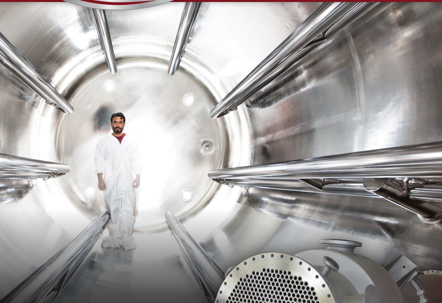
10 Ra. Max Polished Clad Reactor

INNOVATIVE IDEAS WITH CUSTOMIZED SOLUTIONS